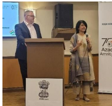
Negotiators from Canada (left) and India at a roundtable with representatives of the business community in Ottawa.