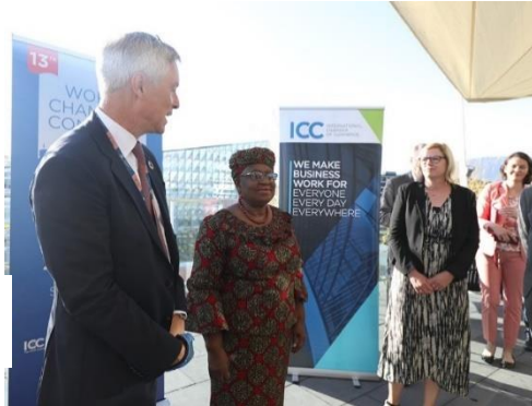
The Director General of the WTO, Ngozi speaking at an event organized by the International Chamber of Commerce